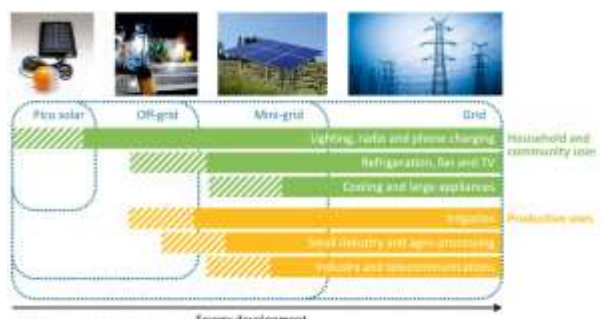
Figure 3: Electricity access and technologies

The transition towards energy access can be defined via the Sustainable Energy for All initiative's multi-tier framework, in which Tier 0 implies no access, Tier 1 implies access to energy for a small light and for charging a phone, while Tier 5 comprises full access to modern energy (World Bank, 2015). Alternatively, the transition can be defined along technology options, as illustrated in Figure 3 below (International Energy Agency (IEA), 2017).