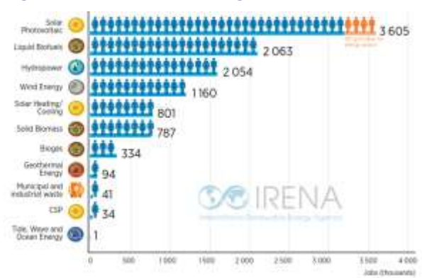
Figure 1: Jobs by technology worldwide, 2018

more than 60% of global solar cell and module capacities ( ibid .).